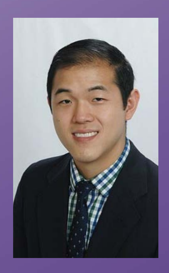
Born in Salt Lake City, UT

He is involved in musical composition and likes to play piano and violin.