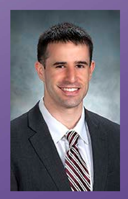
Born in Silver Spring, MD

Loves watching and playing basketball. Enjoys weight-training and practicing Spanish.