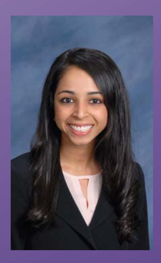
Born in Tirunelveli, India

Has won national awards in Indian classical music.