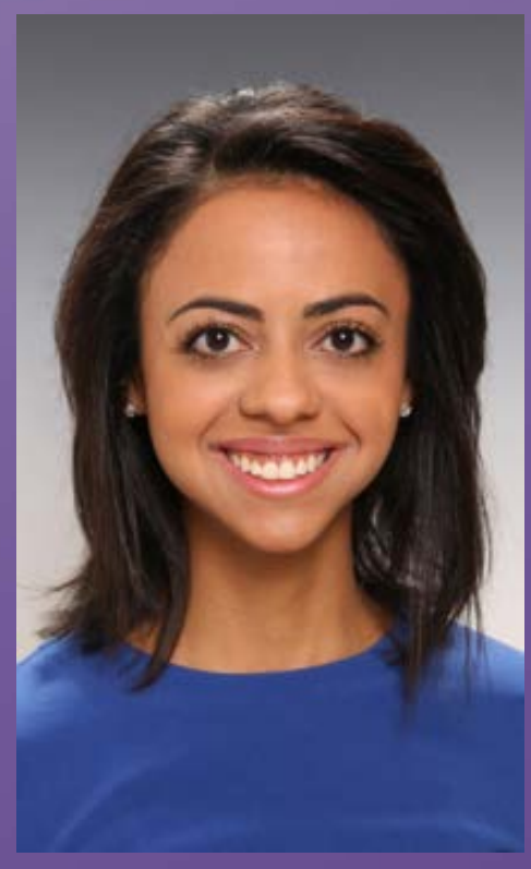
Born in Dayton, OH

Enjoys Pilates, travel, yoga and cooking.