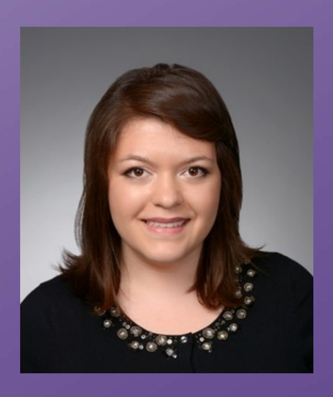
Born in Timisoara, Romania

Speaks German, Romanian, Arabic and some Spanish