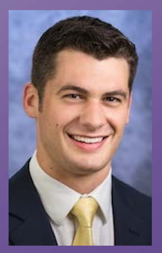
Born in Beaumont, TX

Enjoys skiing, cooking and teaching. Cosmology and contemporary trombone.