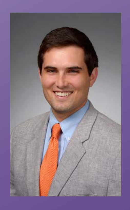
Born in St. Louis, MO