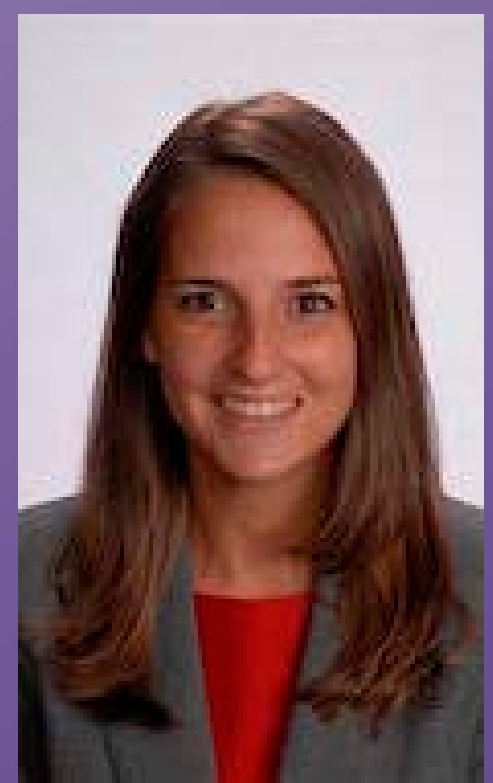
Born in Somers Point, NJ