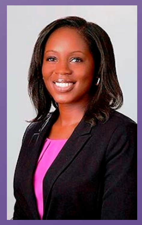
Born in New York, NY

Favorite activities fencing, tai chi and learning to cook Nigerian dishes.