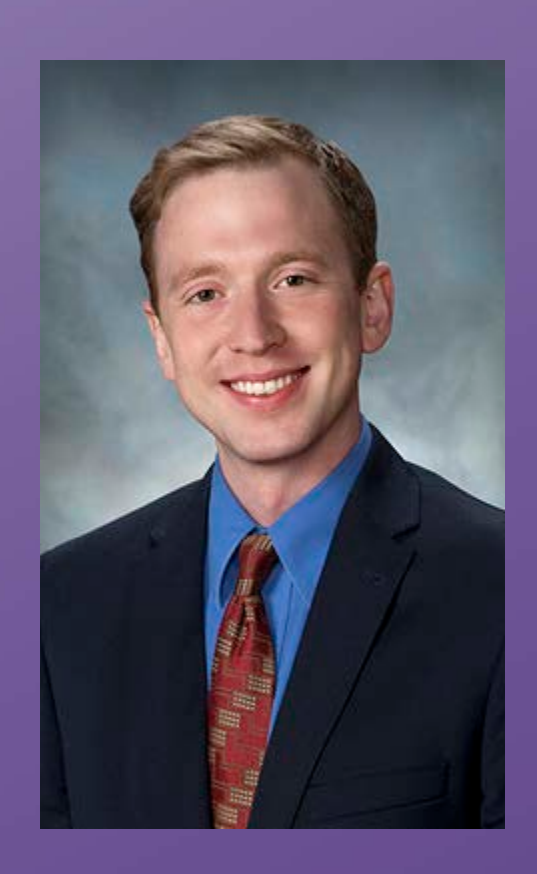
Born in Washington, DC

Enjoys staying informed on current events. Stays active by hiking, running and playing basketball.