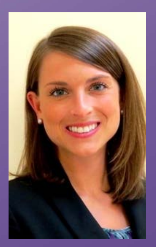
Born in North Carolina

Fitness is her passion. Enjoys soccer, swimming, traveling and listening to live music.