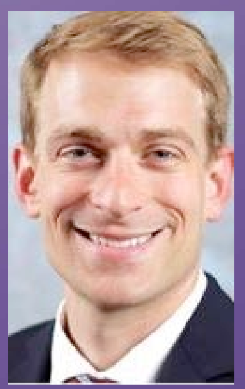
Born in Cincinnati, OH

McGraw-Hill Lange Award for top academically performing student during first year of medical school