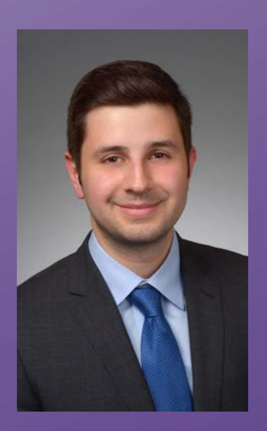
Born in Markham, Ontario Canada

Architecture enthusiast. Has traveled to 4 continents. Loves exercising, reading, skiing and soccer.