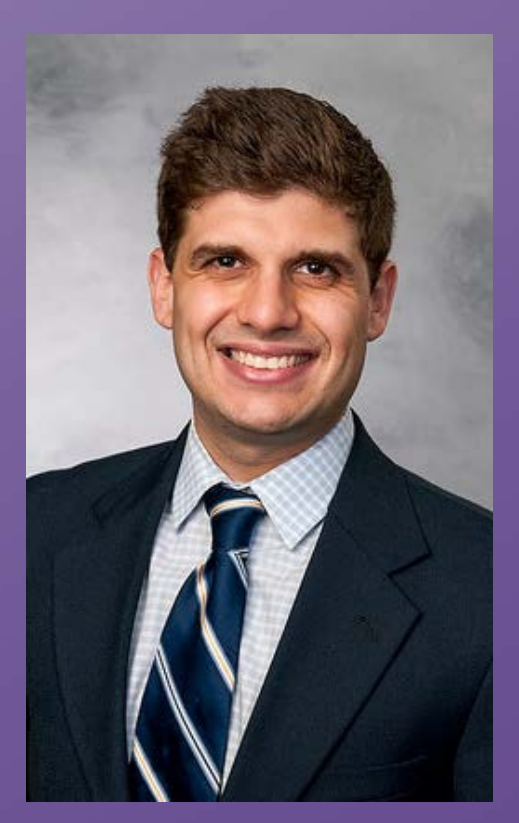
Born in New York City, NY

Aquarium/fish keeping, cooking Spanish food, playing piano, astronomy/space travel, weight training and running.