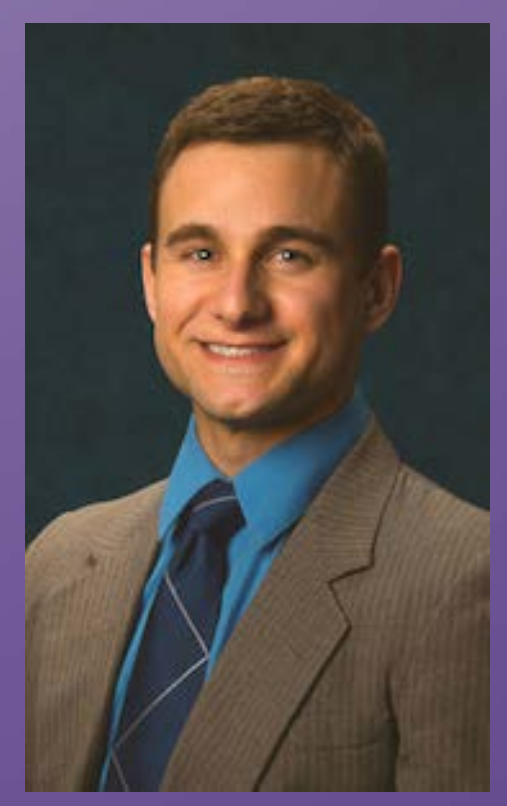
Born in Santa Monica, CA