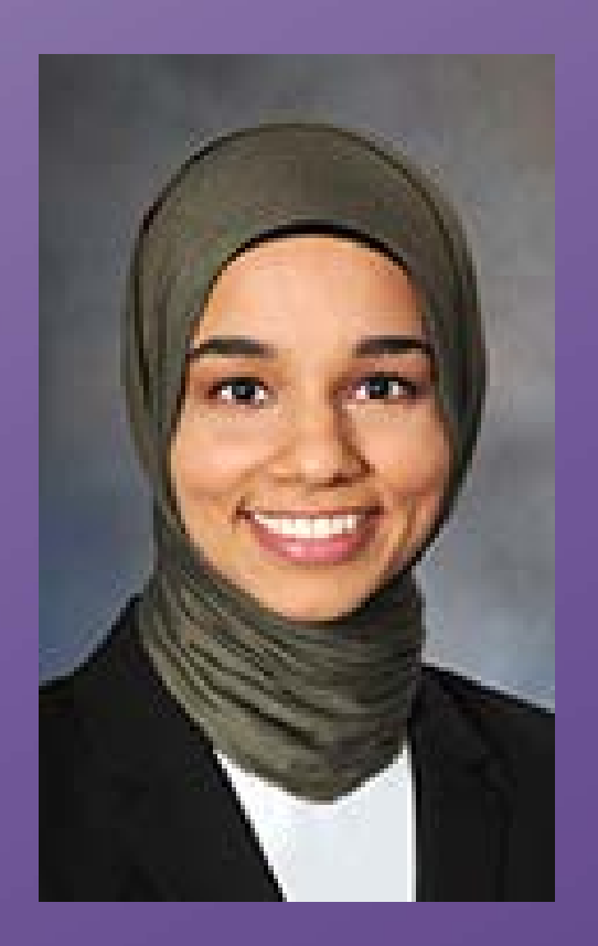
Born in Stamford, CT

Enjoys racquetball, painting, badminton, running, volleyball, and yoga.