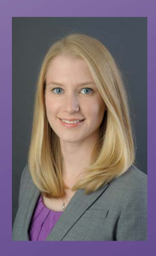
Born in Silver Spring, MD