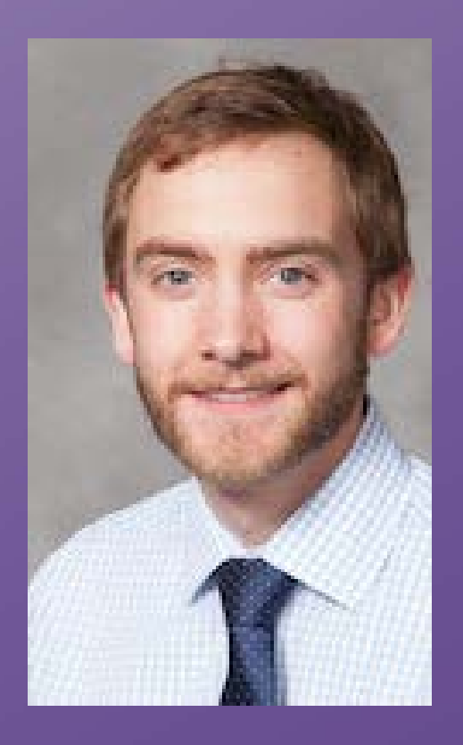
Born in Missouri

Enjoys cooking, music, fly fishing and other outdoor activities.