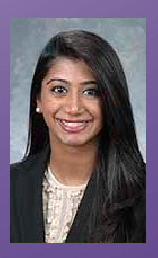
Born in Worcester, MA

Enjoys Indian dance, cooking, baking, painting, arts and running.