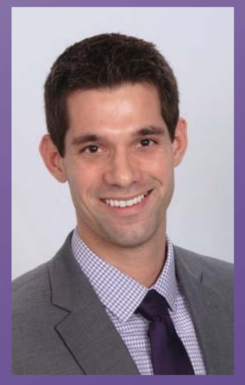
Born in Miami, FL