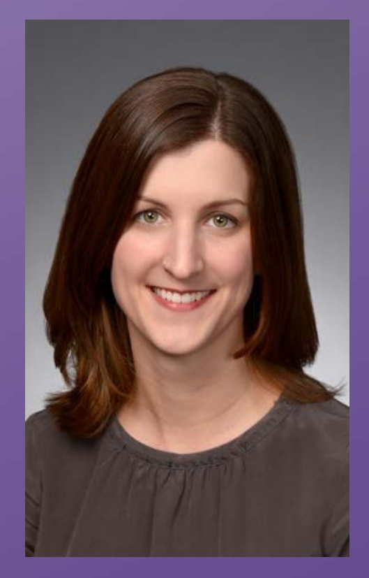
Born in Maywood, IL