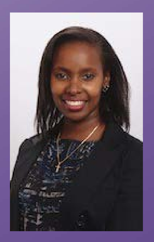
Born in New Jersey

Favorite things cooking, running, playing piano and guitar.