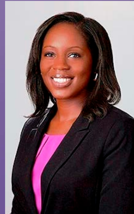
Born in New York, NY

Favorite activities fencing, tai chi and learning to cook Nigerian dishes.