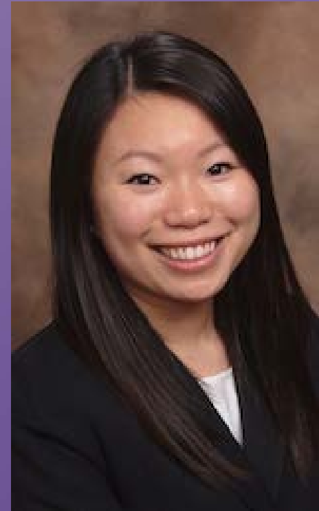
Born In Hong Kong

Loves to hike in California and her favorite hike is in Oahu.