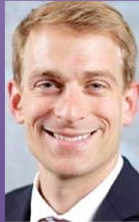
Born in Cincinnati, OH

McGraw-Hill Lange Award for top academically performing student during first year of medical school