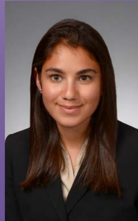
Born in Ohio

Has completed several marathons. Ran the Chicago Marathon in 2013 to raise money for the Epilepsy Foundation of Chicago.