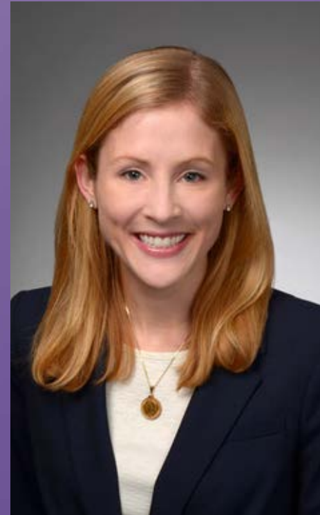
Born in Oak Park, IL