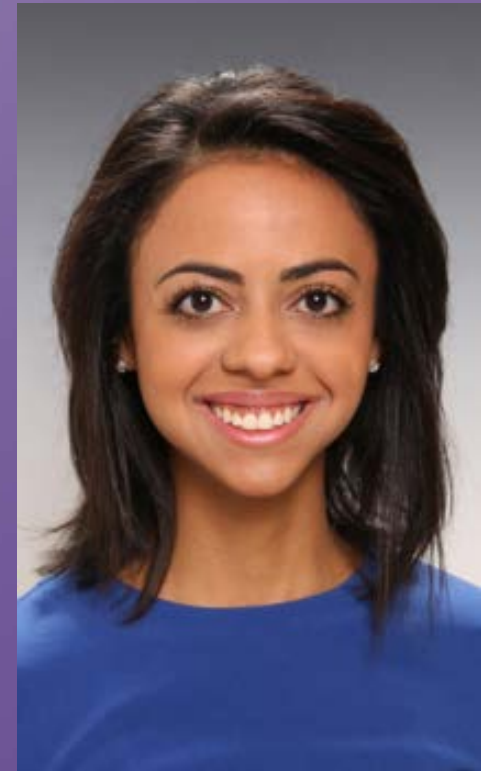
Born in Dayton, OH