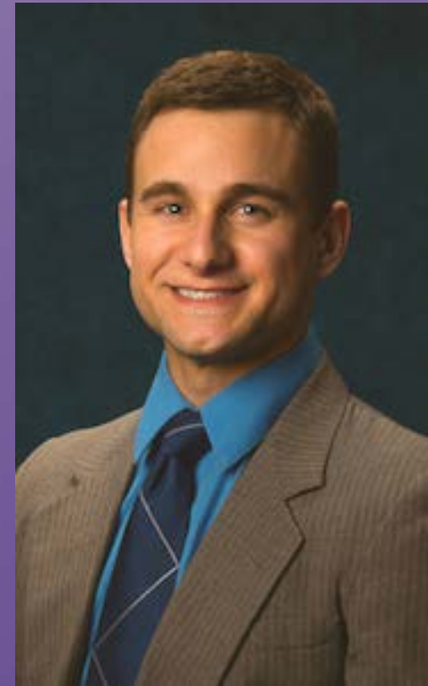
Born in Santa Monica, CA